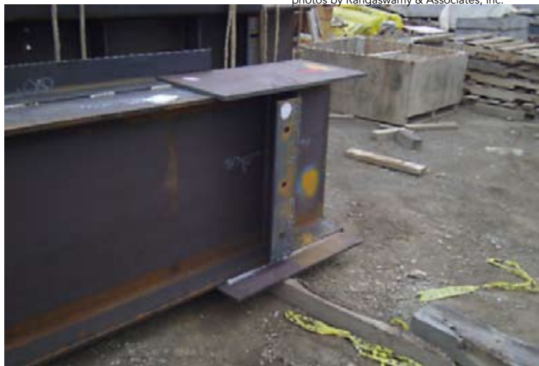
▲ Beam end of the connection.